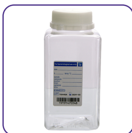
Water Sampling Bottles