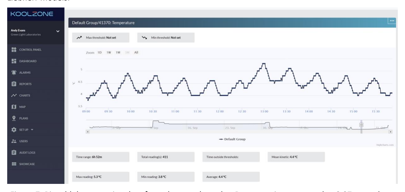
Figure 7. Biocold door opening data from the sample probe. Door openings occurred at 9.37am and 12.31pm.

Door opening data indicated that when looking at the compartment air temperatures the Liebherr unit had the fastest recovery times. It was also noted that the recorded temperature rises were the smallest in the Liebherr unit (under 1C following a 60 second door opening). The Lec unit took approximately twice the time to recover its compartment temperatures compared to the Liebherr unit with the Biocold taking over 4 times longer to recover its compartment temperatures. Furthermore it must be noted that the Biocold was also recovering to warmer temperatures compared to those in the Lec and Liebherr models.