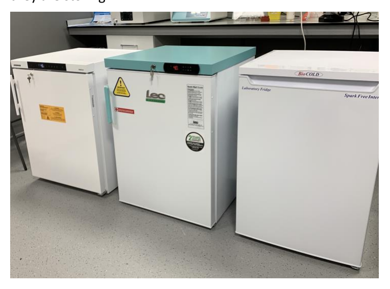
Figure 1. The three units being tested, from left to right, Liebherr, Lec and Biocold.

Fridges are widespread throughout scientific research and teaching. They are found in molecular sciences, life sciences, chemistry and stores departments throughout the UK. With UK labs aiming to minimize their running costs, highlighting the fridge with the lowest running costs is a useful exercise. However, energy consumption values alone would not be serving end user requirements. This study aimed to highlight some of the data and criteria which should be considered when selecting the most sustainable solution based on the specific needs of the researcher, their laboratory and the materials they are storing.