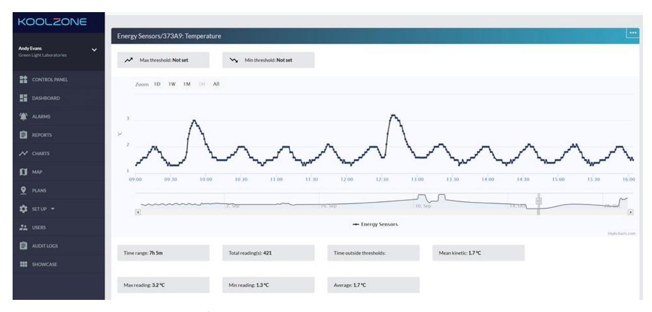
Figure 6. Lec door opening data from the sample probe. Door openings occurred at 9.39am and 12.28pm.