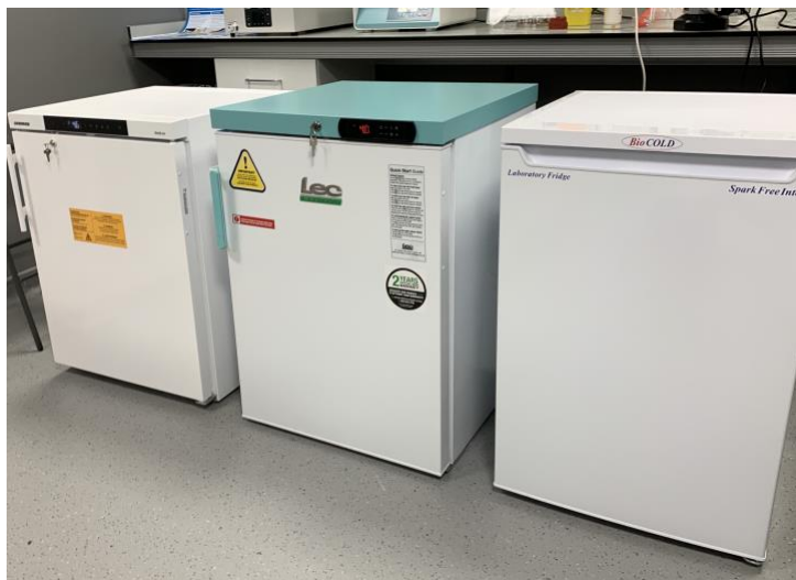
Figure 1. The three units being tested, from left to right, Liebherr, Lec and Biocold.

Fridges are widespread throughout scientific research and teaching. They are found in molecular sciences, life sciences, chemistry and stores departments throughout the UK. With UK labs aiming to minimize their running costs, highlighting the fridge with the lowest running costs is a useful exercise. However, energy consumption values alone would not be serving end user requirements. This study aimed to highlight some of the data and criteria which should be considered when selecting the most sustainable solution based on the specific needs of the researcher, their laboratory and the materials they are storing.