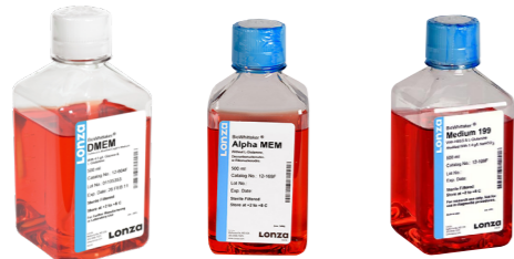
LZBE12-604F LZBE12-169F LZBE12-117F